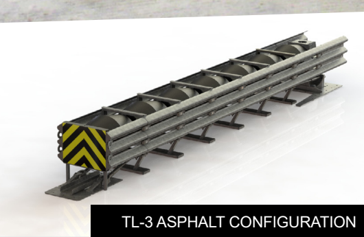
TL-3 ASPHALT CONFIGURATION