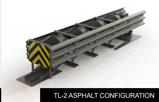
TL-2 ASPHALT CONFIGURATION