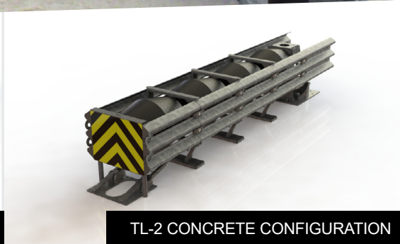
TL-2 CONCRETE CONFIGURATION