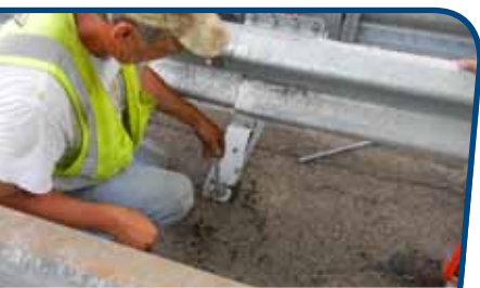
The X-TENUator can be easily anchored to either concrete or asphalt.

The X-TENUator System has been designed to be used in temporary and permanent applications, including workzones that require asphalt anchoring to shield narrow hazards such as portable concrete barrier.