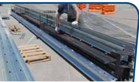
The Orion Portable Steel Barrier has been engineered to utilize standard guardrail. Modules are simple to assemble and easy to repair.

General details for the Orion Portable Steel Barrier are subject to change without notice to reflect improvements and upgrades. Additional information is available from Barrier Systems, Inc.