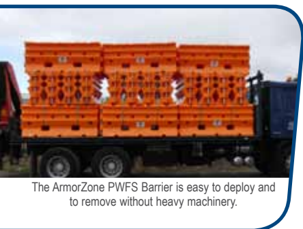
The ArmorZone PWFS Barrier is easy to deploy and to remove without heavy machinery.

General details for the ArmorZone Portable Water Filled Barrier are subject to change without notice to reflect improvements and upgrades. Additional information is available from Barrier Systems, Inc.